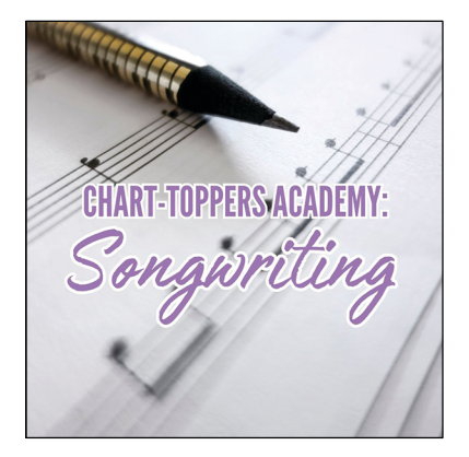
Chart-Toppers Academy: Songwriting

Learn the most popular ukulele songs and have fun playing with others! Ages: 7-11 Dates: June 10-13, 1-4pm July 29-Aug 1, 9am-12pm