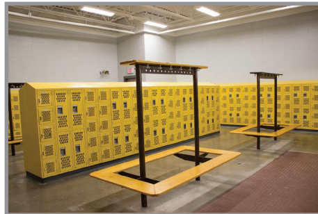
Locker Rooms (2)