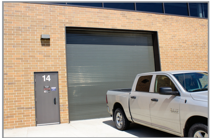
Single-Bay Loading Dock