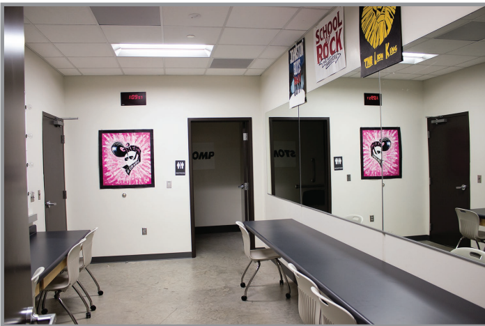
Makeup/Dressing Rooms (2)