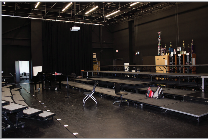
Black Box Theatre