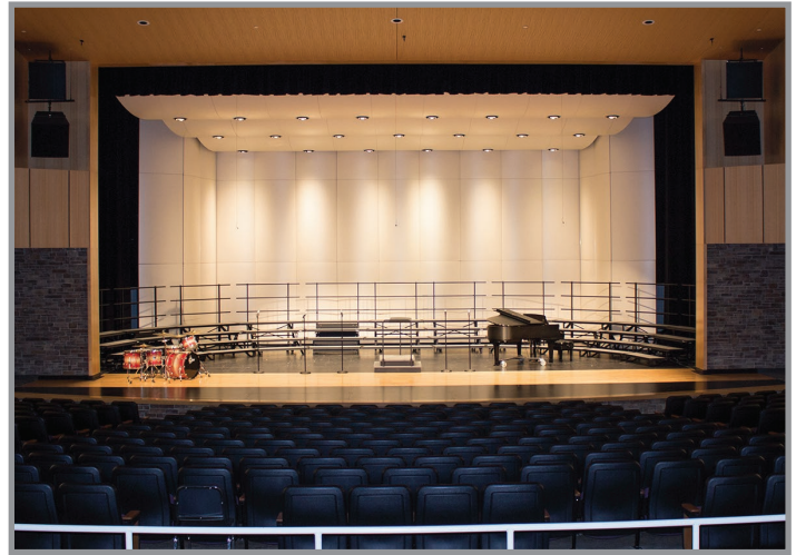
Stage set with risers and music equipment