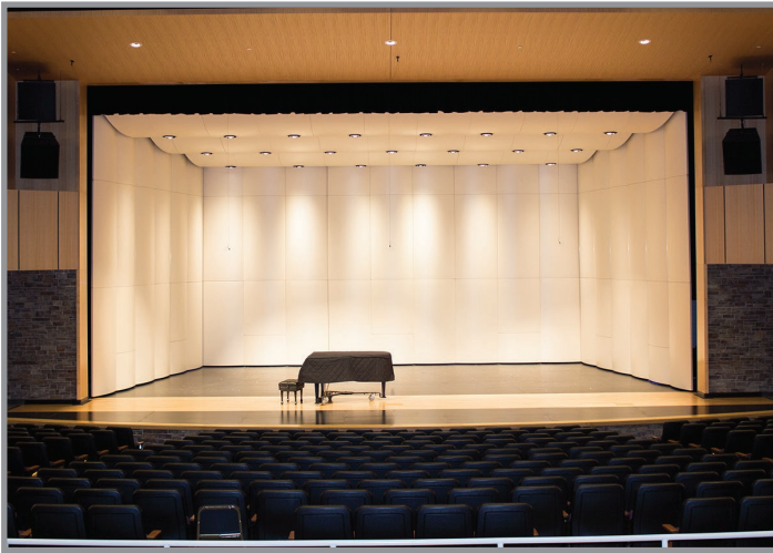
Stage set with white walls enclosing it