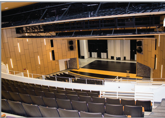
View from the top of the balcony